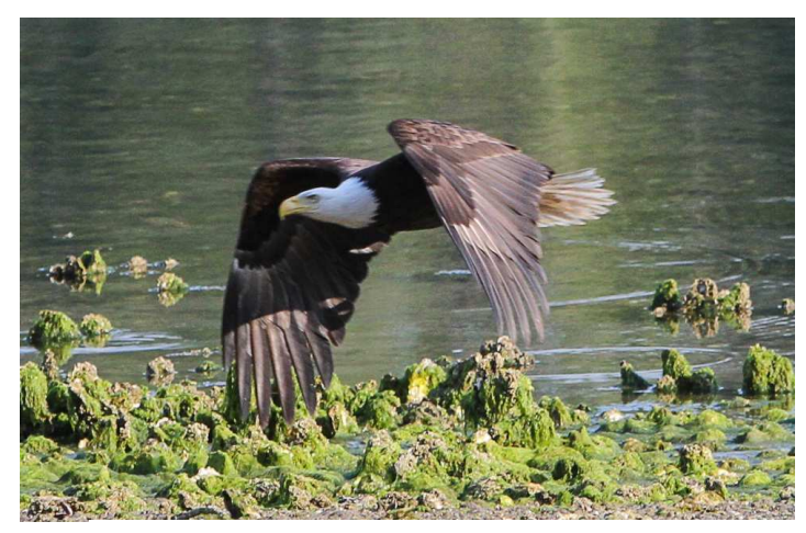
Bald Eagle by Phil Best