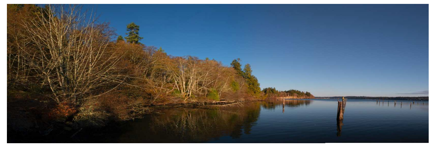
Port Gamble Bay by Don Willott