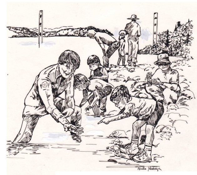
Sketch by Nicki Yarbrough

In April, the HCEC sent a letter to the State Department of Natural Resources (DNR) supporting the Jefferson County Board of County Commissioners' opposition to a proposed timber sale in the Devil's Lake area. We agreed with the Commissioners that this area should be retained in its relatively natural state to protect a unique plant community and other natural resources and to provide recreational opportunities in the Quilcene/Mt Walker area. We also supported the county's request for a 415 acre addition to the existing Natural Resource Conservation Area, including a large portion of the proposed timber sale.