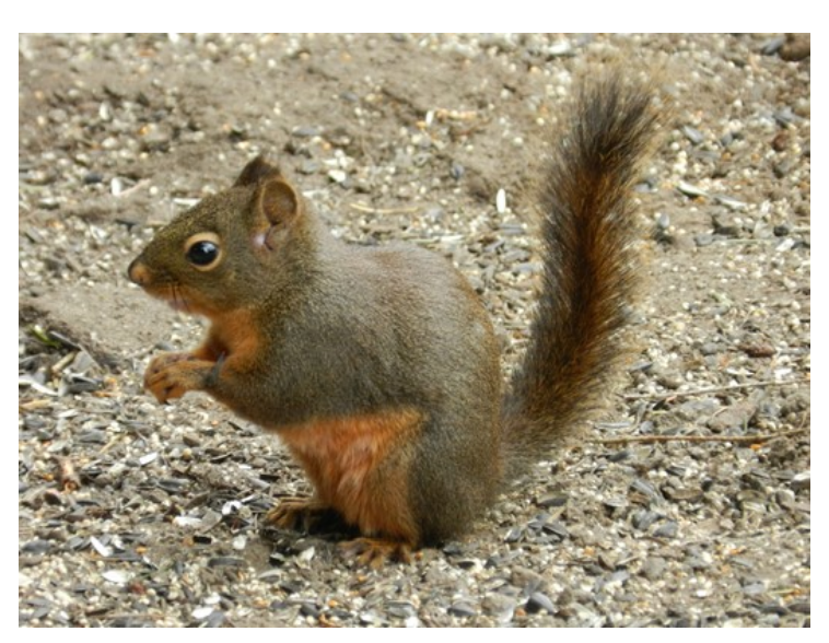
Douglas Squirrel by Bob Wiltermood

Also we are looking a computer person to handle our web page.