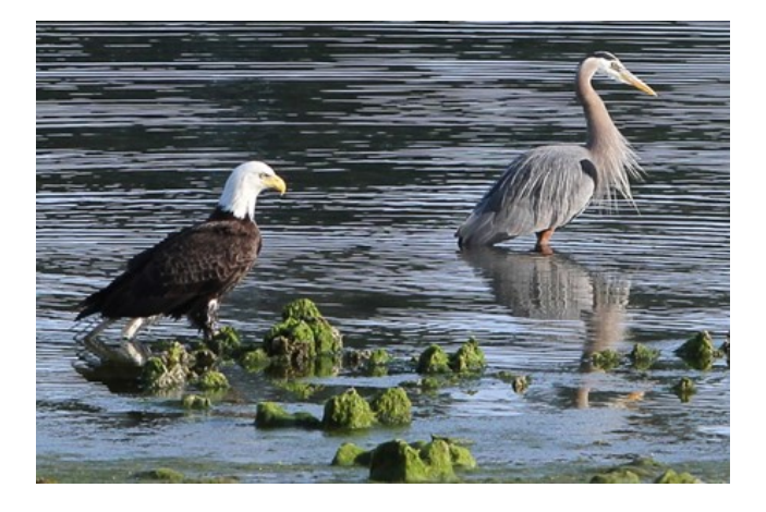
Eagle & Heron by Phil Best

More information about the Port Gamble Bay cleanup project can be found on the WDOE's website at www.ecy.wa.gov/cleanup/3444.html or the Port Gamble S'Klallam Tribe's website at www.PortGambleBayCleanup.com.