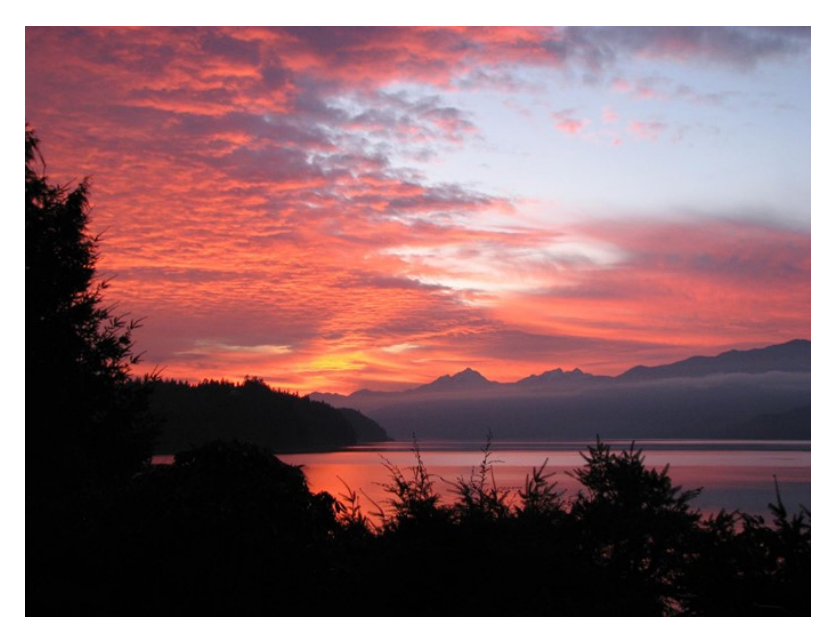
Hood Canal & Mt. Washington

This newsletter and back issues can be read online at http://www.hoodcanalenvironmentalcouncil.org.